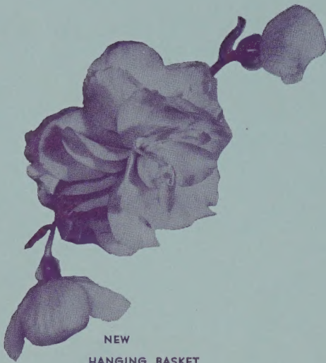
NEW HANGING BASKET TYPES

This blend of types and colors covers practically all the finest of the Tuberous Begonia family. Many of the tubers are sorts that we sell at $1.25 each or when grown into plants, $2.50 per plant to our own retail trade. In addition to most of the finest standard types and colors this blend has many new forms and colors which are the result of our extensive breeding program. These add novelty and value to this blend because many of these are available no other way. You'll find them useful for attracting attention to your Begonias as well as to supply that special customer who wants something different. Additional to the Camellia, Carnation, Crispa, Cristata and Rosebud forms this blend contains newer types such as the new Duplex, Peonie, Dahlia, Cactus, Hibiscus and Ruffled forms as well as some of the early crosses of an entirely NEW RACE of Picotee Types. Coloring of course is most varied. About 5% to 10% Pendula types are included in both Lloydii and Camellia form if desired.